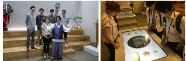
Fig. 6 Visiting Museum Kimchikan