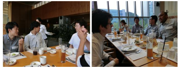
Fig. 5 Networking party

that is a Korean typical food, and also some of traditional goods, e.g. Hanbok (See Fig. 6).