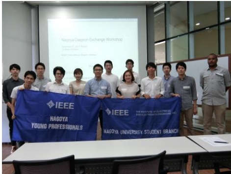
Fig. 4 Photo of all participants

The differences and reasons of the low PhD students' populations and young researchers in academia were commented, and the potential reason in Japan could be that there are not many advantages in work types and salaries either holding PhD. In Korea, many PhD work in the industry because of high workload and few positions in academia.